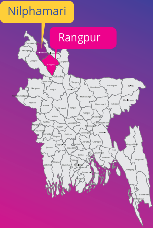
Map of project location