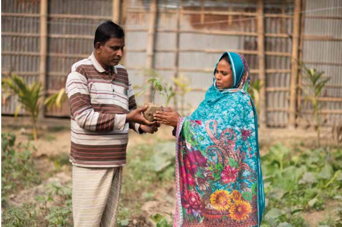
JANO's support has been of immense help in making sure the Union Parishad implements its annual plans.