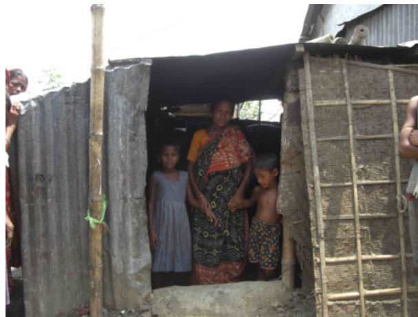
Young widow and her two of her children, Rishipatti

A fourth, younger widow, and the mother of three young children (photo below) had been invited to join EKATA, but said that she was unable to attend meetings at the times they met (3-5 pm each day) because she was working as a maid at that time. Her house was the most humble in the immediate neighbourhood. It was the impression of the researchers who interviewed her that she was especially struggling to maintain her children and herself in difficult circumstances.