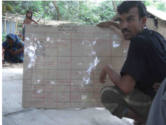
Community Action Plan (CAP)

The VDC formation was therefore a 'top-led' effort in Kewarejore. The poor and extreme community really did not take a lead in decisions regarding the leadership; rather, at some point of time they endorsed it. To these ends it is not surprising that the study team finds at Kewarejore the VDC Chair is a rich - but pro-poor - local elite who has a career of about two decades of being a UP Chairman. Similarly, two other members, by economic category, do not represent the poor and the extreme poor; though "they are always acting on behalf of us," as one respondent commented.