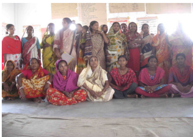
Rishipatti EKATA group

A key element concerning capacity concerns the building and use of social capital to strengthen and promote reliance on fellow householders. The study finds in the sites visited very strong social capital among members of EKATA groups. EKATA members were carrying out a variety of activities, e.g. helping members to learn to write. Also to build confidence: several members stated to the international research team members that, before EKATA, they would not have had the confidence 'to speak to foreigners.'