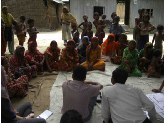
Village focus group meeting