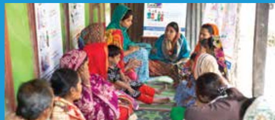
A Birth Planning (BP) session is facilitating by Community Health Volunteer (CHV)