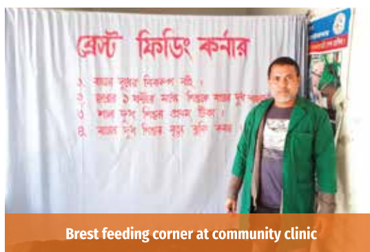
Brest feeding corner at community clinic

Breastfeeding is the ideal method of feeding and nurturing infants for their optimal nutrition, growth and health. One of the barriers found in the implementing districts from the formative study it is found that 21.8% Community Clinic has breast feeding corner in both the districts. With this realization Raiganj upazilla established 41 breast feeding corner in all its community clinics. Community Group (CG) and Community Support Group (CSG) members took the lead with the support from Community Health Volunteer (CHV), Community Health Care Provider (CHCP) and overall CG members who ultimately mobilized the local resources worth BDT 16,400. Now CHV/female CHCP can demonstrate breast feeding process in that corner.