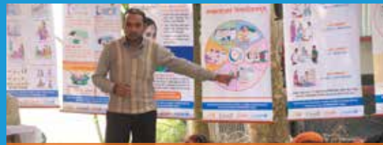
A government health manager is briefing child health issues in a mothers gathering

Birth preparedness is a process of dialogue at family level with husbands and in-laws of pregnant women having the resources and information prepared to respond quickly in case of an emergency. 1,400 Community health volunteers (CHV) are trained on this preparedness skill in Sirajganj and patuakhali. This process includes: transportation, where to go and any needed supplies, saving money to pay for transport, a skilled attendant at delivery, knowledge of danger signs and community resources for emergencies to deliver with a skilled attendant.