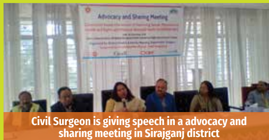
Civil Surgeon is giving speech in a advocacy and sharing meeting in Sirajganj district

As part of inception of the project, district and upazila level advocacy and launching meeting were held to share the project strategy, approach and the roles of different stakeholders. Deputy Commissioner, Civil Surgeon and Deputy Director - Family Planning (DDFP) of Sirajganj and Patuakhali districts took the lead to make the event successful.