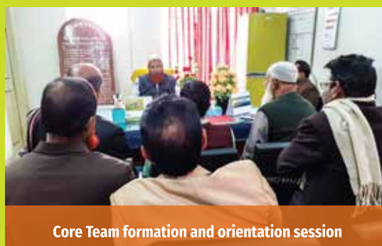
Core Team formation and orientation session

Core team is a key strategy of ImSRHR&MNH project to make the project sustainable and ensure quality of services with accountability. CARE Bangladesh, having a good relationship with Community Based Health Care (CBHC), formed the district level core team followed by upazila level team in meeting with district level health and family planning department. However in the orientation session they developed the district and upazila yearly plan.