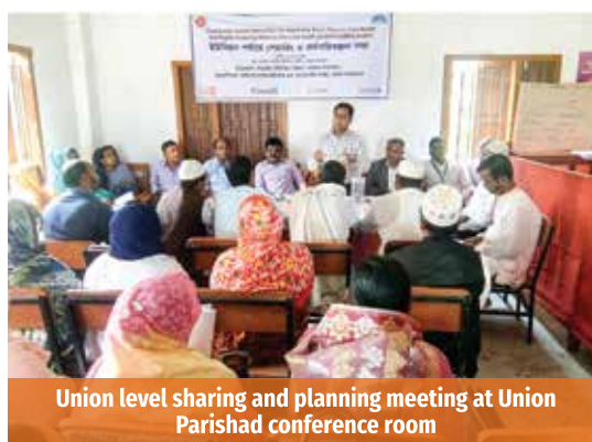
Union level sharing and planning meeting at Union Parishad conference room

After completion of rapid formative assessment (RFA) and compilation of findings, CARE Bangladesh's facilitators mobilized community level stakeholders to share the findings and develop a union plan, based on the problems revealed in the RFA. The key stakeholders. Consecutively local government started raising cash and kind contribution to address the existing problems of CC, UH&FWC, financial support to poor pregnant women for seeking institutional delivery and transport to hospital.