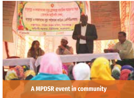
A MPDSR event in community

ImSRHR & MNCH assisted first line health supervisors of the MOH&FW conducting total 158 MPDSR in Sirajganj and Patuakhali district till September 2019. MPDSR is considered to be creating momentum in maternal and child death issues taking it as an important social intervention carried out at community level following a maternal or neonatal death. It cross-examines social bottlenecks related to a maternal or neonatal death and device mechanism to create a congenial environment in the community. In this process 30-40 people participate including representatives of CG and CSG. In this process the front line health workers request the community to tell the story around a death, probe further to let community identify the gaps to avert similar deaths in future.