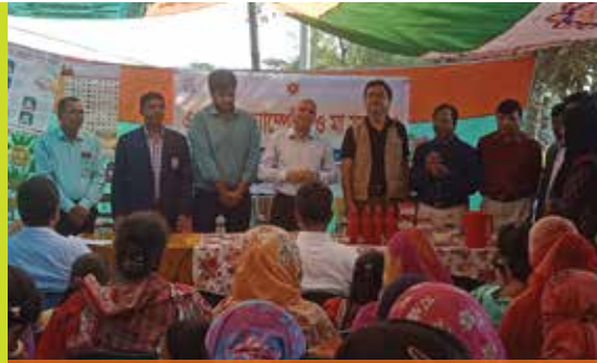
Representative from donor organizations and government official visited at intervention areas

United Nation International Children's Emergency Fund (UNICEF), Global Affairs Canada (GAC), Government of Bangladesh (GoB) high officials visited the field level activities of ImSRHR&MNH project at Patukhali. The visitors interacted with the participants of a courtyard session conducted by a CHV in creating positive health seeking behavior of women and adolescent girls related with SRHR.